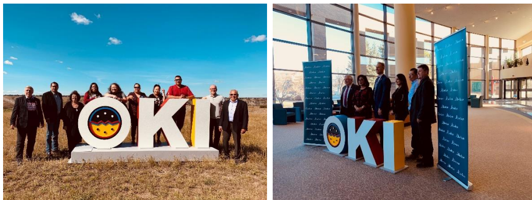
Images of the City of Lethbridge's OKI Signs in the community.

In 2019, the City of Lethbridge Heart of Our City Committee and the Reconciliation Lethbridge Advisory Committee partnered to develop an OKI Sign as part of the celebration of 2019 as the United Nations International Year of Indigenous Languages and the adoption of Oki as the official greeting of the City of Lethbridge. Since 2019, the City's two OKI Signs have been seen throughout the community at special events and celebrations.