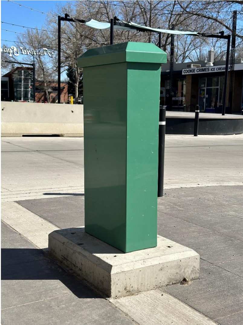
Location 3: Festival Square, along 6 th Street S Near Once Upon a Bride and The Telegraph Approximate Dimensions: 38.5" (h) x 8" (w) x 17.5" (l)