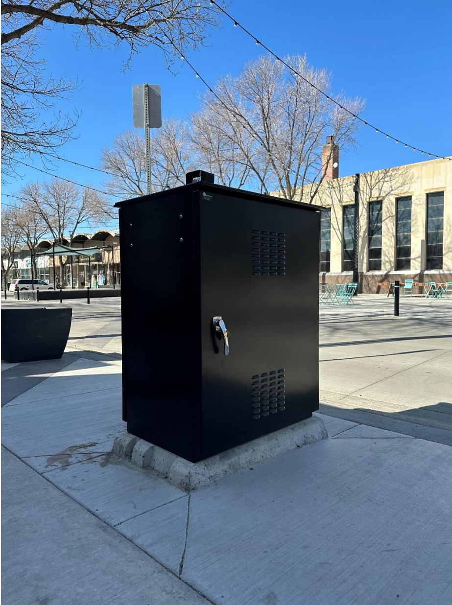
Location 2: Southeast corner of 3 rd Ave S and 6 th Street Near Cookie Crimes and Pita Pit Approximate dimensions: 47" (h) x 27" (w) x 36" (l)