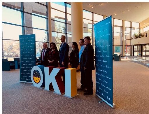
Images of the City of Lethbridge's OKI Signs in the community.