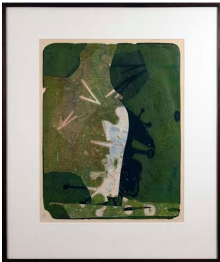
Harold Town, Centaur Entering a School of Barbizon Forest , City Art Collection

In 2024, the Recreation and Culture Department working in partnership with the Public Art Committee will develop a new Public Art Master Plan. The Plan will include public engagement to confirm the vision and mandate and to identify future public art sites and opportunities. A condition assessment of existing public art pieces will be conducted as part of Plan development. Internal Public Art Committee structures and processes will also be reviewed. The updated Public Art Master Plan will be funded by both administrative and programming funding and through the maintenance reserve as outlined in the 2022-2026 Public Art Work Plan.