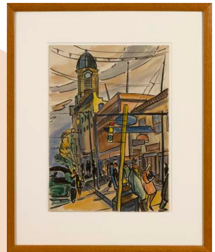
Bart Pragnell, Street Scene with Block Tower , City Art Collection