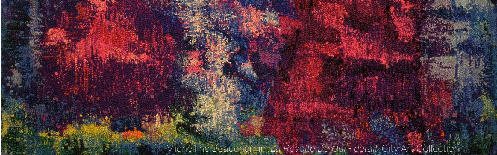
Michelline Beauchemin, La Révolte Du Qui - detail , City Art Collection