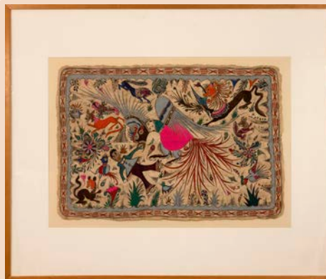
Pancho Tlaminque, Untitled , City Art Collection