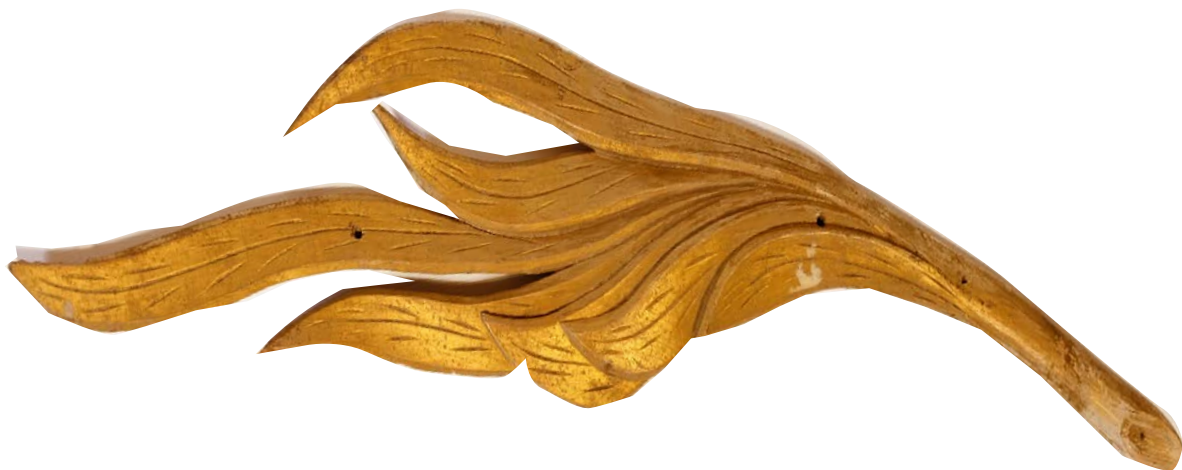
Unknown Artist, Palm Leaf , City Art Collection

The City of Lethbridge Fine Art Collection – 23 pieces of fine art acquired with Fine Art Acquisition funds allocated under Public Art Policy CC30 and the preceding Fine Art Acquisition Policy.