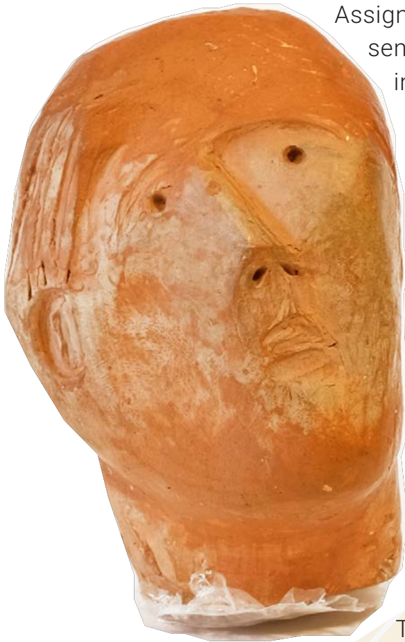
Jacques de Tonnacour (Attr.), Sculpted Head , City Art Collection

The Public Art Committee endeavors to increase public access to and knowledge of the Buchanan Bequest and the Fine Art Collection. Following a review of the collections with the University of Lethbridge, the Committee decided in June 2022 to assign management oversight of the Buchanan Bequest and the Fine Art Collection to the Galt Museum and Archives. Council was informed of this decision via an Information Update in September 2022. Transferring oversight to the Galt is an important step towards increasing public access to, and understanding of, the historical importance of these collections.