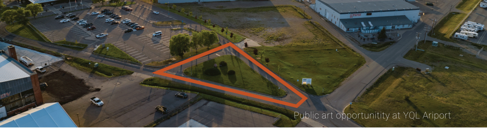
Public art opportunity at YQL Aripport