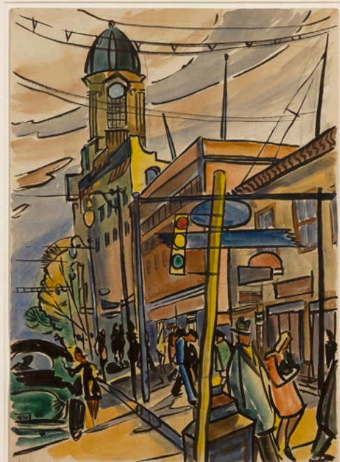
Street Scene with Block Tower Bart Pragnell

Work to complete the specified transfers is underway. All transfers and disposals should be completed by the end of 2027.